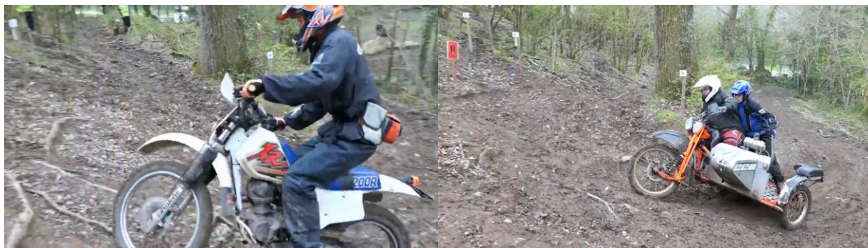
Best Solo 2019 – Tristan Barnicoat