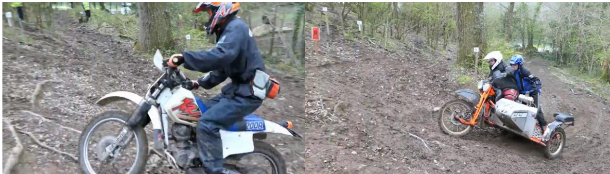
Best Solo 2019 – Tristan Barnicoat