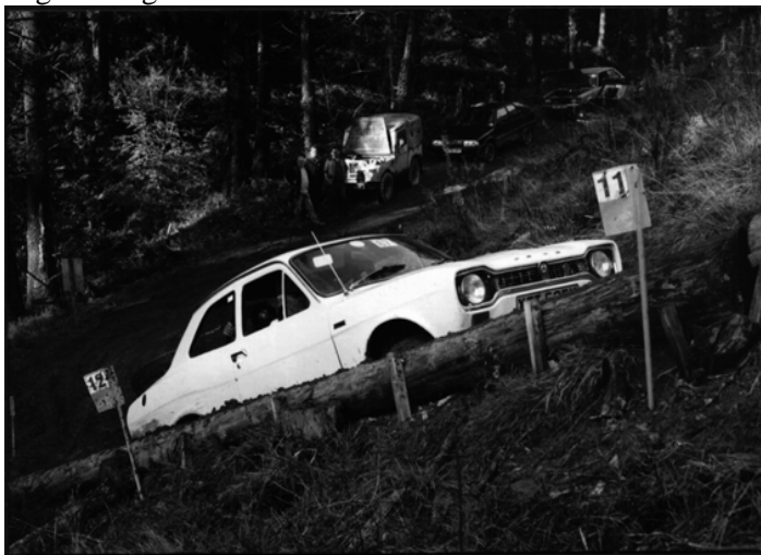
(Bodmin Trial 1997)